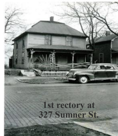
1st rectory at 327 Sumner St.