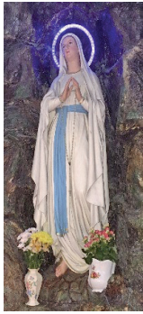
Que soy era Inmaculada Concepcion