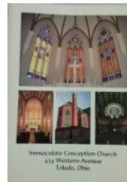
Immaculate Conception Church 414 Western Avenue Toledo, Ohio

Please join us for a grand celebration in a neighborhood that is truly seeing a major turnaround in its fortunes!