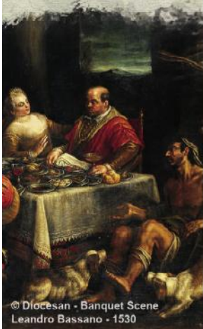
Banquet Scene Leandro Bassano - 1530