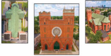
Immaculate Conception est. 1868